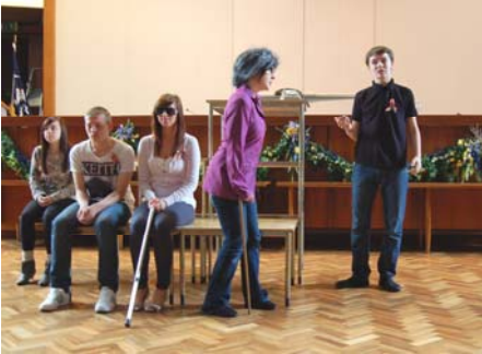
Bishop Auckland Theatre Hooligans performing at IDAHO conference

The County Durham Lesbian Gay Bisexual Transgender (LGBT) Steering Group organised an event to mark IDAHO day on 17 th May 2011.