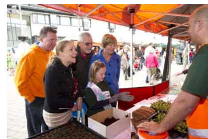
Visitors at the bees and butterflies planting stall